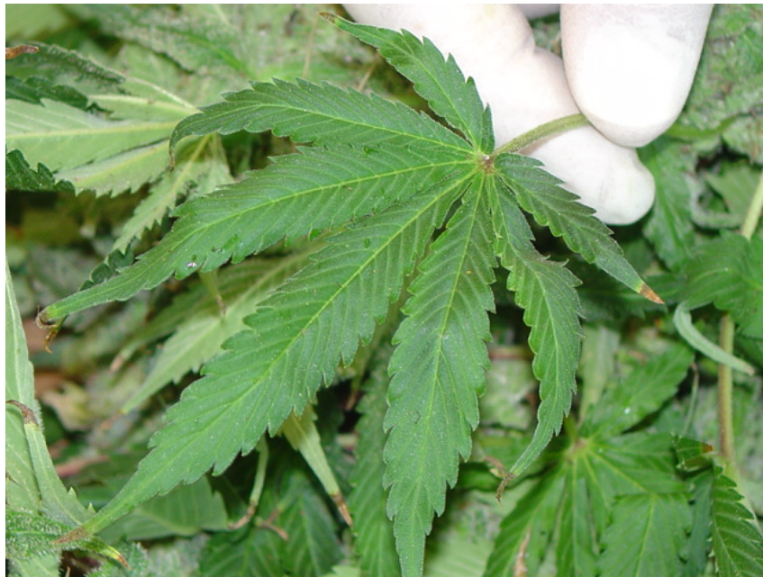
Marijuana leaf.

The illegal drug trade creates a global black market economy that puts the public at risk, not just from the substances being distributed, but also from the subsequent crimes committed by users, traffickers and manufacturers. These crimes typically include burglary, assault and fraud, but can also involve more serious crimes such as homicide, abduction and human trafficking.