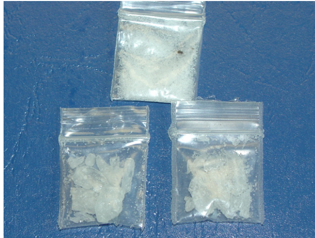
Crystal methamphetamine.

Evidence collected during an investigation involving illegal drugs can include the substance itself, containers used to transport the substance, utensils used to manufacture or use the substance, or in the case of manufacturing, the component chemicals used to create an illegal substance. Drugs can take the form of pills, powders, liquids, plant material such as leaves and mushrooms, crystalline materials (crystal methamphetamine), and cases such as MDMA or ecstasy, can be imbedded in paper or foods like candy.