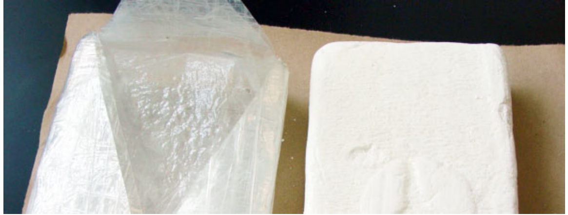
Bricks of bulk cocaine, a common packaging method used to transport drugs for trafficking.

Forensic drug chemistry is used in cases involving the possession, trafficking or manufacturing of a suspected illegal substance. An investigator with a reasonable suspicion that an individual or individuals are in possession of an illegal substance may perform presumptive testing at the scene. Depending on the results of the presumptive test and agency procedures, samples will typically then go to the forensic laboratory for confirmatory testing. Analysts answer basic questions about suspect materials including: